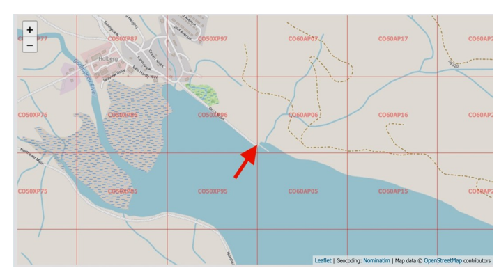
Map courtesy of <a href="https://dxcluster.ha8tks.hu/">https://dxcluster.ha8tks.hu/</a> <a href="https://dxcluster.ha8tks.hu/">hamgeocoding/</a> showing the CO50/CO60 grid border line at Holberg, BC.

It looked perfect with plenty of room to setup and good sky visibility (i.e., more open water than trees). In one corner of the gravel parking area, we noticed a 1980s vintage Toyota Land Cruiser with right-hand drive, and an elderly gentleman seated in a camp chair beside it. We introduced ourselves and found that he was visiting from New Zealand, having shipped his Land Cruiser from down under to Canada. He has done this a few times and to various locations. He was camping in Holberg and was excited to hear about our operating plans for two days later