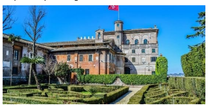
The main building in Rome for the Order of Malta's Italian Relief Corps (CISOM) which hosted the 1AOC operation

Millionaire,' I decided to phone a friend. Since this friend is an ex-chairman of the ARRL's DX Advisory Committee I suspected that he might know the answer to my question. Indeed he did. Apparently CISOM applied for DXCC status in 1981 and on investigation it was realized that not only did CISOM have its own ITU call sign designation, but they also issued passports and stamps. Although the land in Rome is small, CISOM had all the trappings of a small country and so was granted DXCC status. Also, my investigations revealed that the relief, medical and humanitarian work carried out by this relief corps is truly amazing.