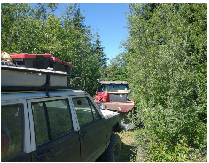
Part of the fun of maintain the ITS repeaters is getting to some of the remote sites as this picture illustrates