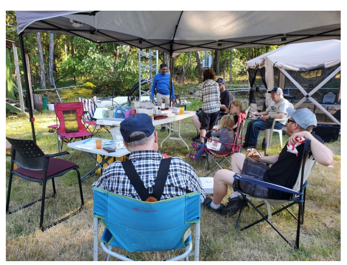
Overview of the Canada Day set up with stations set-up in the cabin and close by using several tents