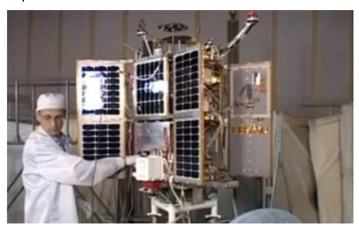
The RS44 satellite pictured under construction

I had planned to work the new medium earth orbit satellite called GreenCube (IO-117). This bird has a packet digipeater as its communication option, and with its higher orbit it has simultaneous coverage of almost a full hemisphere of the Earth. This would allow QSOs much farther abroad than North America, and several Japanese and European stations had expressed interest in working me on this rove. Unfortunately, a few days before the trip the satellite went offline and remained so during the rove. So, no DX on this expedition. It is back online now, and we are already considering a return to CO50/CO60 in September to work it.