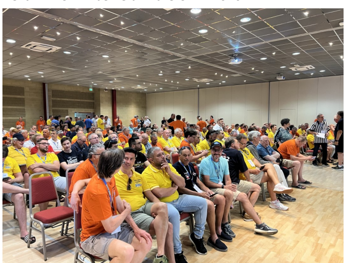
WRTC 2023 contestants and referees waiting for the assignment of call signs to the participating groups

I did not work I44W, the winner, on 20m CW, but I did work I43C (DJ5MW & DL1IAO) who were second, and also I49D (9A7DX & 9A3LG) who came in third. Because covid caused some disruption to the WRTC schedule the next WRTC will be held in the UK in 2026.