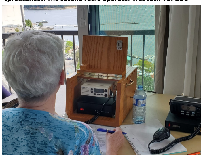
The marine operator provided by the Bathtub Society was in communication with the bathtub chase boats on Channel 73