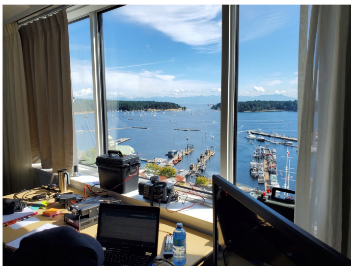
The view across Nanaimo harbour from Bathtub control on the 12th floor of the Coast Bastion Hotel

This year's winner of the Bathtub race was Brandon Skipper in a new record time of 1 hour 43 seconds.