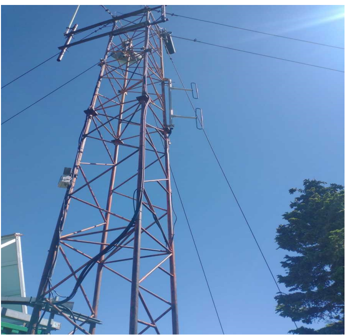
The 2022 NIARS projects included several of the north island sites critical to the Island Trunk system

It's not too late to attend or visit and if you are interested please contact Devan VE7LSE (ve7lse@gmail.com)