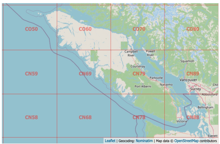
Map courtesy of <a href="https://dxcluster.ha8tks.hu/">https://dxcluster.ha8tks.hu/</a> <a href="https://dxcluster.ha8tks.hu/">hamgeocoding/</a> showing the Maidenhead grids that cover Vancouver Island.

There are eight Maidenhead grids that cover Vancouver Island: CN69, CN78, CN79, CN88, CN89, CO50, CO60 and CO70 (Figure 1.).