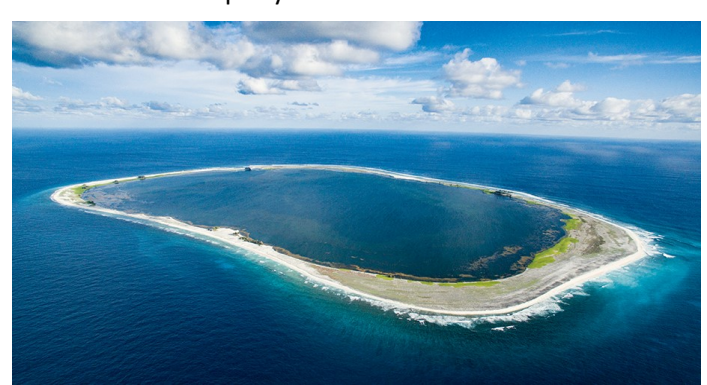
Clipperton Island, a good path from Nanaimo

Finally, a reminder that this month the Clipperton Island DXpedition is scheduled to start on Jan. 18 and be operational for 16 days. The call sign to be used will be TX5S and this DXpedition should provide strong signals into the Nanaimo area. Clipperton Island is an uninhabited coral atoll in the eastern Pacific Ocean, uninhabited except by sea birds and millions of crabs.