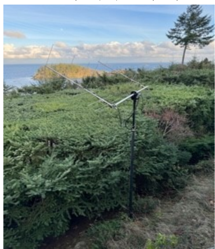
VE7PTN home station satellite antenna consisting of an M2 LEO Pack antenna system with an AlfaSpid RAS azimuth and elevation rotator. View is looking east towards Vancouver.

I could replace my antennas with their big brother units from M2. This would double the boom length and number of elements on each antenna. But the turning radius would be the same so they could fit my location. For UHF, according to the manufacturer ratings, my UHF gain should go from 11.16 dB to 13.36 dB. For VHF it would be from 7.06 to 10.2 dB. Modest increases, but at