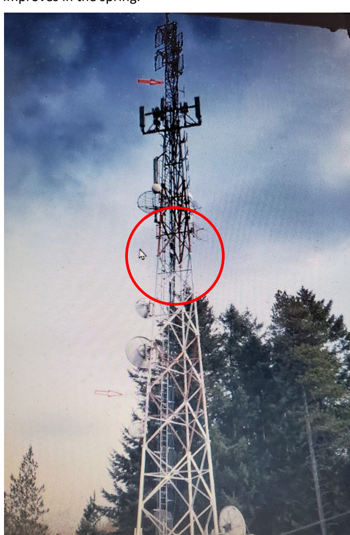
The NARA 5 GHz sector antennas at Cottle Hill will be located at around the height shown by the red circle

NARA has been working with Island Communications (located on Bowen Road in Nanaimo) to put up three 120-degree 5 GHz sector antennas at its Cottle Hill location. Which tower is to be used for the NARA antennas and the location on the towers has been decided. The next steps will happen when the weather improves in the spring.