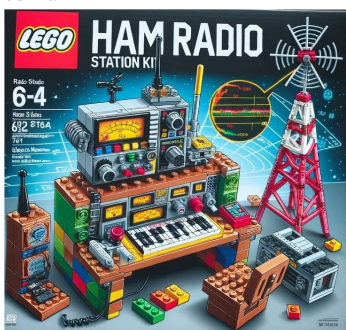
The LEGO ham radio station kit

LEGO, the Danish Company which makes those interlocking plastic bricks popular with children and adults, is well known for a variety of kits. But who knew that they made an amateur radio kit, pictured below. And when the NARA Newsletter team looked at this, we discovered that LEGO also had a Field Day setup. What we want to know is where is the LEGO NARA Newsletter crew kit?