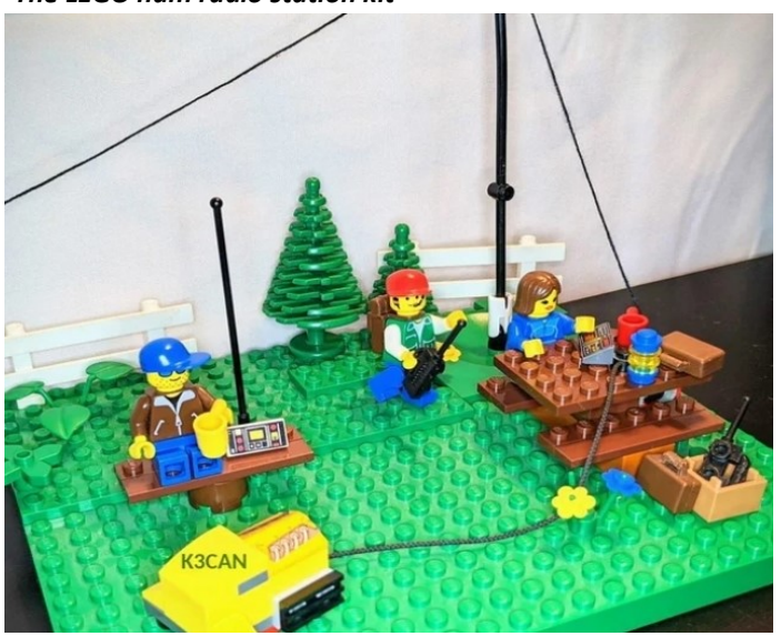
The LEGO field day