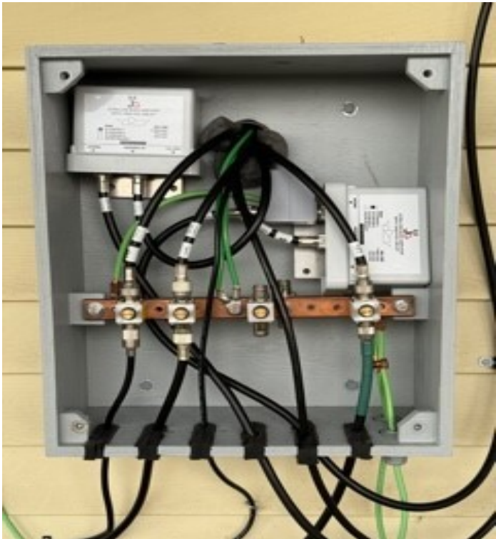
VE7PTN home station antenna coax junction box (cover removed) showing temporary installation of LNA external preamplifiers and mode J filter (on LNA on right side)

www.jghitechnology.com/waterproof?lang=en). I decided to get both UHF (JG-ULNA70VOX-E) and VHF (JG-ULNA2VOX-E) units from Italy for a cost of €450.00 (Euros), including shipping ($700 CAD). In a few weeks they arrived from Italy without any additional duty or taxes owing, perhaps because the shipper listed them as "video game parts," worth €20 (Euros) on the export documents! Before I cut into my nice coax at the antenna mast to install the necessary N-connectors to receive the units, I decided to do a test installation in the junction box just outside my shack space. I have lightning arrestors here, so it was a simple procedure to disconnect them and install the LNAs in their place.