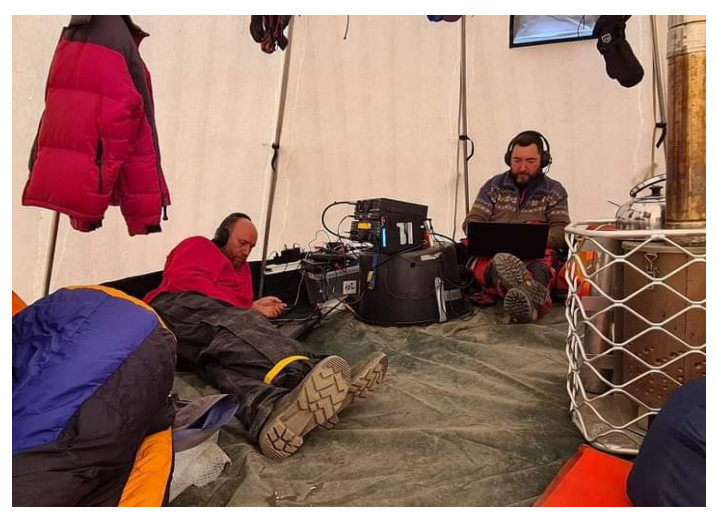
The 3YOJ operating tent. Notice that the group were not able to get tables or chairs onto the island.

moved to 30m CW and I started to hear a very weak signal which was below my noise and difficult to read. At around 8 pm our time their signal started to build a little and at that stage I managed to complete a CW QSO. Undoubtedly one of the most difficult CW contacts I have ever made, with very low signal strengths and regrettably much deliberate QRM. At the time the 3YOJ signal was so weak that I was only able to read about 70 per cent of what was being sent. But when 3YOJ replied to me I thought I heard my complete call sign quite clearly. Imagination perhaps? About half an hour after my contact the 3YOJ signal came up in strength to 539. The strongest that I ever heard 3Y0J on 30m CW was 549 on Feb. 9, when the solar flux exceeded 300. On all other bands I never heard anything on CW at all. I know of one other station on Vancouver Island, VE7CT, who also made a 30m contact with 3Y0J.