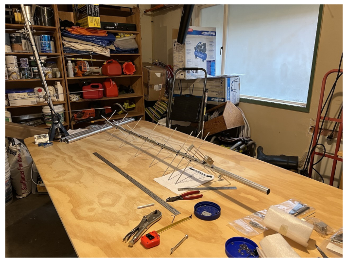
Completing assembly of the M2 LEO Antenna System; the VHF array is in a holder on the left and the mostly complete UHF array is in the center.

In researching antenna options, you may come across satellite "eggbeater" antennas. They may sound tempting as they can be hidden in your attic and do not require a rotator. Again, I do not have personal experience with these but from what I hear from other operators they are not worth the price – the performance is too poor to be useful