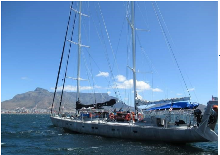
On Friday Feb. 24 the team made it safely back to Cape Town and were greeted by a number of South African amateurs

There is another group, the Intrepid DX group, considering another Bouvet Island DXpedition. It will be interesting indeed to hear their plans.