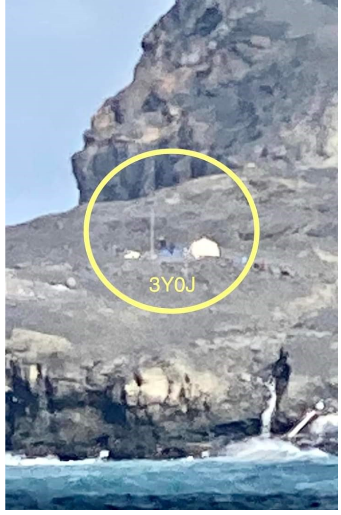
The location of the 3J0J campsite on the SE side of Bouvet island, showing the difficult terrain

The propagation models – I looked at two different ones – suggested that propagation should have been possible from Nanaimo to Bouvet on all bands from 30m to 10m. Different bands would be open at certain times of the day and for differing periods of time. What the propagation models did not take into account was the location of the 3YOJ campsite on Bouvet Island, located on the south-east side of the island at Cape Fir. A 780-meter high mountain within four kilometers of the campsite (with the ground rising all the way from the camp) between 3YOJ and North America was clearly an issue. In practice, the 3YOJ 30m signals were audible into the southern US; but into the Pacific northwest signals on modest wire antennas were extremely low with much lower signal strengths than expected.