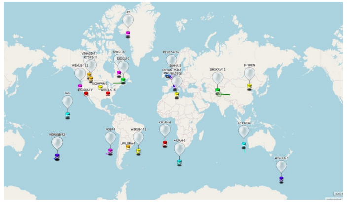
Amateur radio high altitude ham balloons as of Feb. 1, 2023

One expert estimated that around 1,000 weather balloons are launched every day around the globe. One high-altitude balloon manufacturer in Florida said, "at any given moment, thousands of balloons are above the Earth, including many used in the United States by government agencies, military forces, independent researchers and hobbyists."