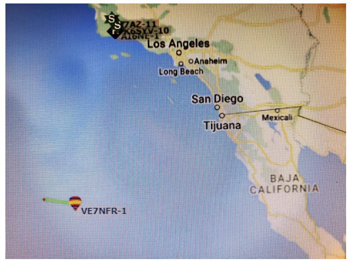
The location of the VE7NFR-1 APRS balloon on Feb. 25, one day after its launch, next stop across the USA to Africa!

In more balloon news, the North Fraser ARC launched an APRS balloon VE7NFR-1 from Maple Ridge at around 2 pm on Feb. 24. Almost one day later the balloon was South of the Mexican border, southwest of San Diego.