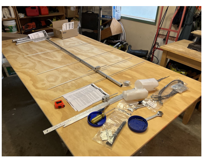
Getting started on the M2 LEO Antenna System assembly; the VHF array is half built, the remaining parts are on the right.

9CEC477AA3B819EE02831F3FD5B8). The G-5500 requires a separate interface unit for the controller. The best option for this is the S.A.T. Controller by CSN Technologies: <u>http://www.csntechnologies.net/sat</u>. My preferred Az/El rotator is the Alfa Radio RAS (<u>http:// www.alfaradio.ca</u>) for its solid design and included computer interfacing with the controller. I f you already have an azimuth-only rotator, then using this with a fixed elevation of about 30 degrees will allow you to work most satellite passes. For coax I recommend using LMR 400 or equivalent to maintain good transmission from the antenna to your shack, especially for the UHF side. (There are antenna-mounted pre-amps available that will allow you to compensate for lossy coax.)