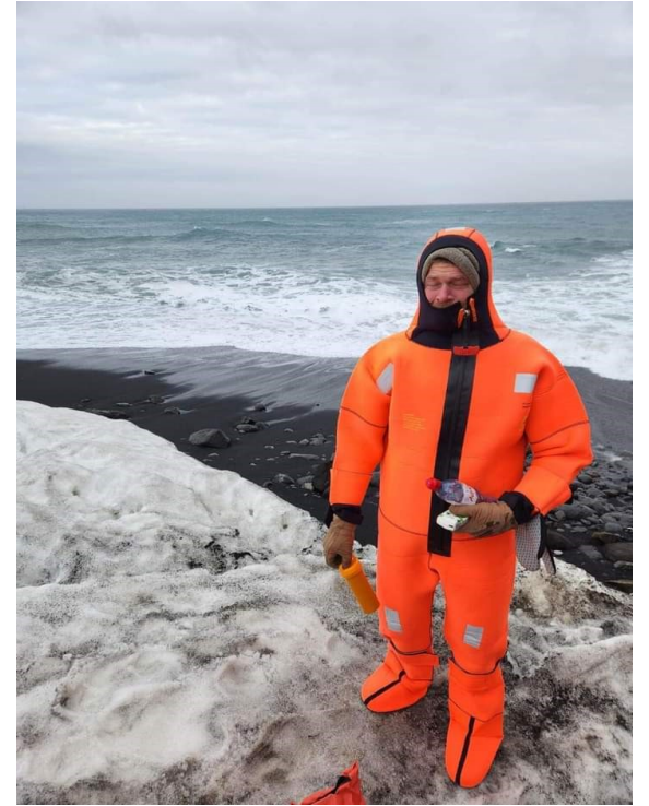
One of the team in their bulky survival suits

The 3YOJ team on Bouvet, as anticipated, had problems getting their equipment onto the island due to very harsh conditions. Dangerous beach landings were accomplished by holding onto a line attached to a buoy and floating 15 meters in rough surf to the beach while dressed in survival suits. All of the equipment had to be floated onto the island this way and then carried 800 feet up to the camp. As a result, none of the heavier equipment could reach the island and the team had to rethink their activities. All that they managed to get onto the island, radio-wise, was a small Honda generator, two 100W radios and simple antennas; no beams or high power.